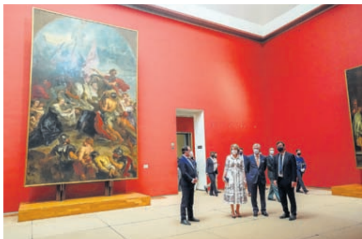
Belgium's King Philippe, center right, and Belgium's Queen Mathilde, center left, wear face masks, to prevent the spread of coronavirus, as they visit the Royal Museum of Fine Arts in Brussels, Tuesday, May 19, 2020.